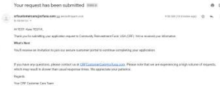
Figure 2: Image of email confirmation of prequalification form submission