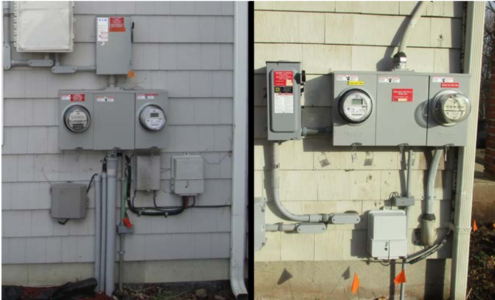
Figure 3: New Multi-Gang Meter Enclosures in Existing Underground (left) and Overhead (right) Electrical Services

For both overhead and underground electrical services, the existing meter enclosure can be replaced with a multi-gang enclosure to accommodate the new “tenant” at this location. Figure 3 shows an example of the new multi-gang meter enclosure method. This is currently the only allowable option for underground electrical services.