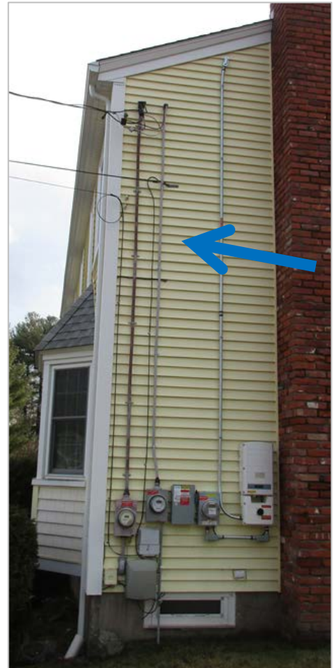
Figure 4: New REG Electrical Service in Parallel with Existing

For overhead electrical services, an alternative to replacing the existing meter, is a connection at the service point with a parallel service drop to the new REG meter. Figure 4 shows this alternative connection method with the PV system components. This method does not alter any existing electrical components, however consideration should be taken for the overhead splice methods that will likely be exposed to the weather.